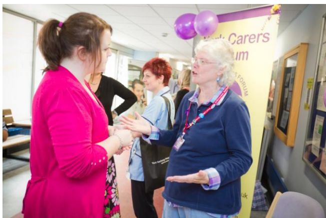
Discussing the new Bereavement Suite...