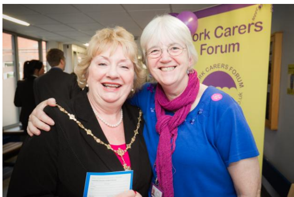
Meeting the Civic Party...