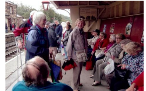
We wait for our